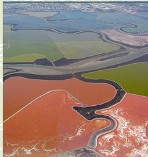
Aerial view of the San Francisco Bay wetlands and salt ponds.

We keep this meaning in mind as we evaluate the DOJ’s business policies and practices to reduce our negative impact on the environment and promote the wise use of natural resources. In the last year, we have taken a lead role among other government agencies by adopting environmentally friendly business