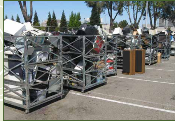
Eleven cages of e-waste collected at the Broadway office in Sacramento.

savings of 68 percent per cartridge. Remanufactured toner cartridges are made from used materials, which reduces landfill waste.