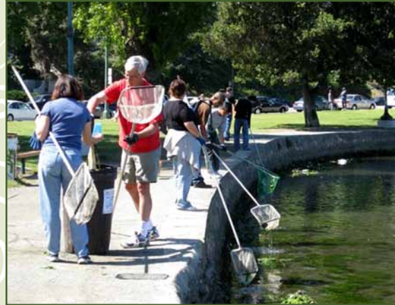
Oakland office's Earth Day 2008 Lake Merritt cleanup.