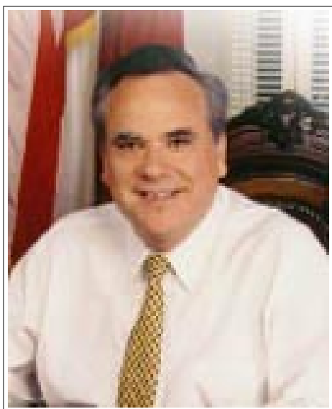
BILL LOCKYER Attorney General

During 1998, six out of ten adult felony arrests resulted in a conviction, and the sentence most often given was probation with jail. Adults convicted of violent offenses or drug offenses most often received sentences to prison, 18.1 percent and 26.0 percent, respectively.