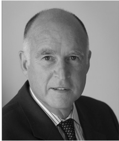
EDMUND G. BROWN JR. ATTORNEY GENERAL

As chief law officer of California, the Attorney General is responsible for ensuring that state laws are uniformly and adequately enforced. The Attorney General carries out this constitutional responsibility through the programs of the Department of Justice. The Attorney General's specific charges are threefold: to provide legal representation, to support common law enforcement, and to protect consumers and the environment.