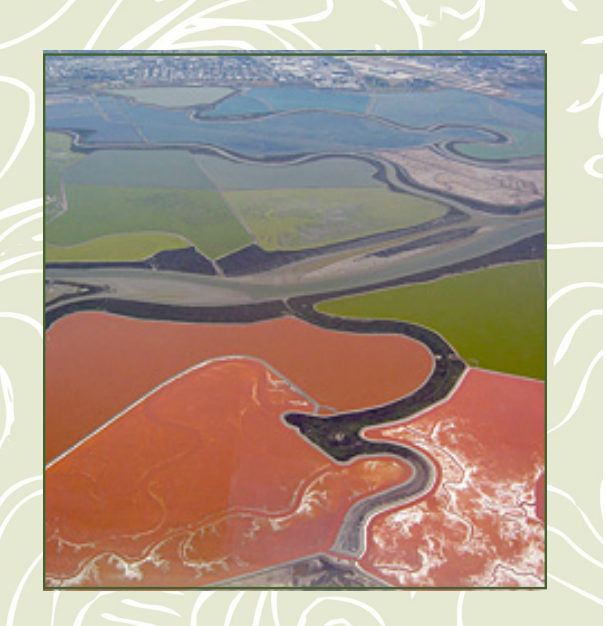
Aerial view of the San Francisco Bay wetlands and salt ponds.

We keep this meaning in mind as we evaluate the DOI's business policies and practices to reduce our negative impact on the environment and promote the wise use of natural resources. In the last year, we have taken a lead role among other government agencies by adopting environmentally triendly business