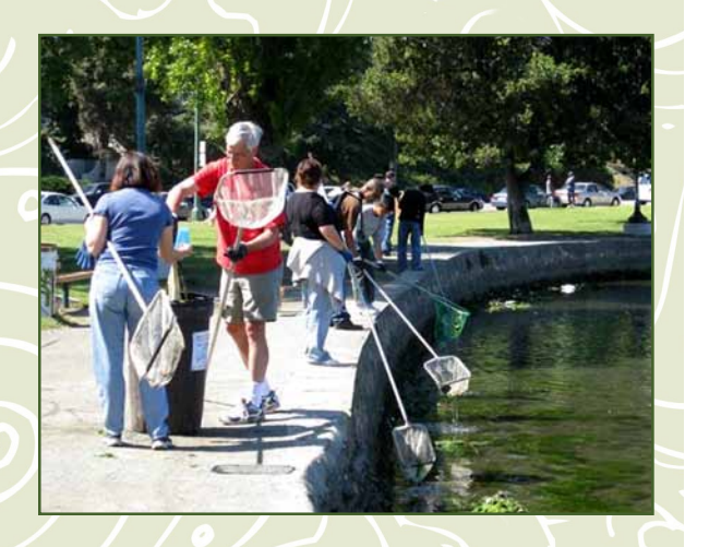
Oakland office's Earth Day 2008 Lake Merritt cleanup.

Created "GreenFlash," a periodic e-mail sent to employees that provides information on an environmental topic.