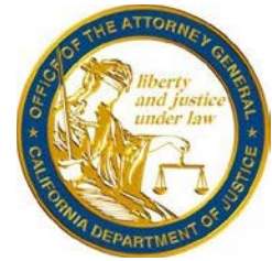
XAVIER BECERRA ATTORNEY GENERAL