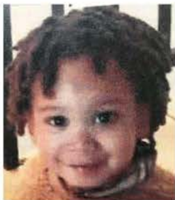
Arius Ace Supre Bermudas