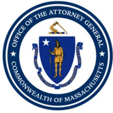
ANDREA JOY CAMPELL ATTORNEY GENERAL OF MASSACHUSETTS