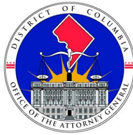
KARL A. RACINE ATTORNEY GENERAL