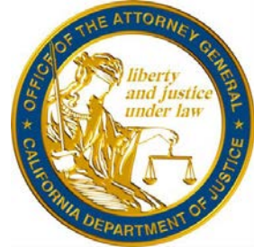
XAVIER BECERRA ATTORNEY GENERAL