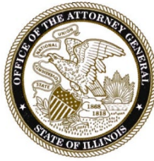
Office of the Illinois Attorney General Kwame Raoul