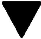
EXHIBIT A DESIGNATED SYMBOL