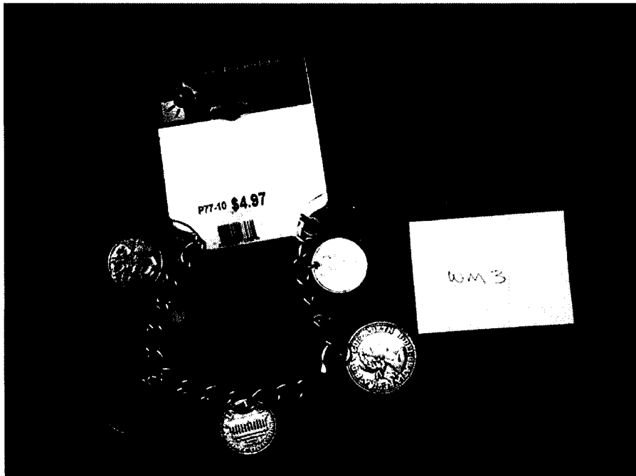
Product ID 7 33399 16368 0