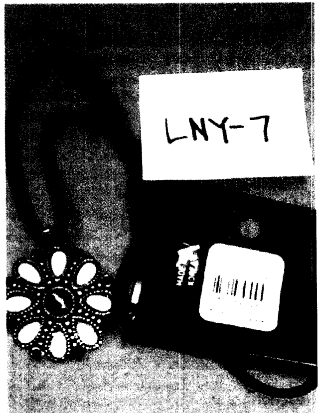
Product ID 85084546