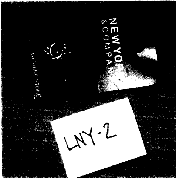
Product ID 85074446