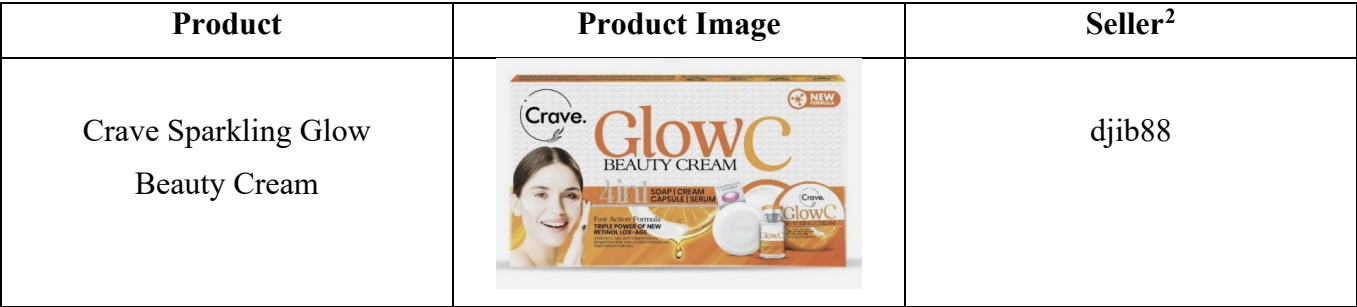
Table 1: Exemplar Products